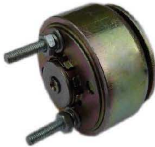
总重量 Total Weight: 45g 应用范围: 玩具等 APPLICATION: TOY etc