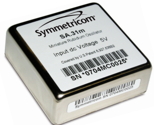
SA.3Xm Miniature Atomic Clock

The SA.35m is the premium grade of the entire SA.3Xm family. It has better aging, tempco and stability performance amongst all the versions of the family. It is ideally suited for specific holdover and test and measurement applications. Economical for its performance level, the SA.35m delivers premium performance at a reasonable price.